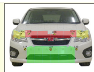
Adult leg impact (upper and full legforms)